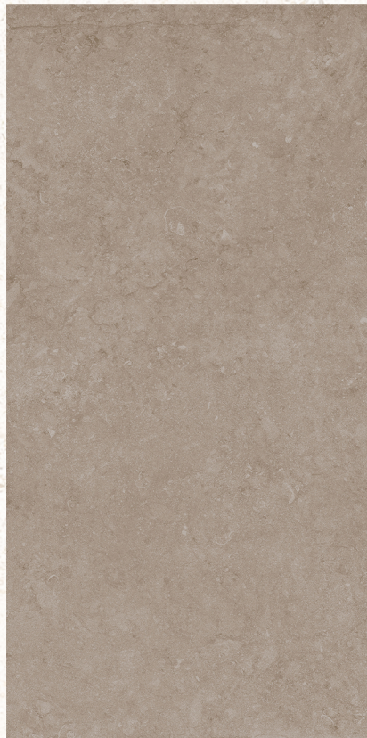
CORTILE Refined concrete