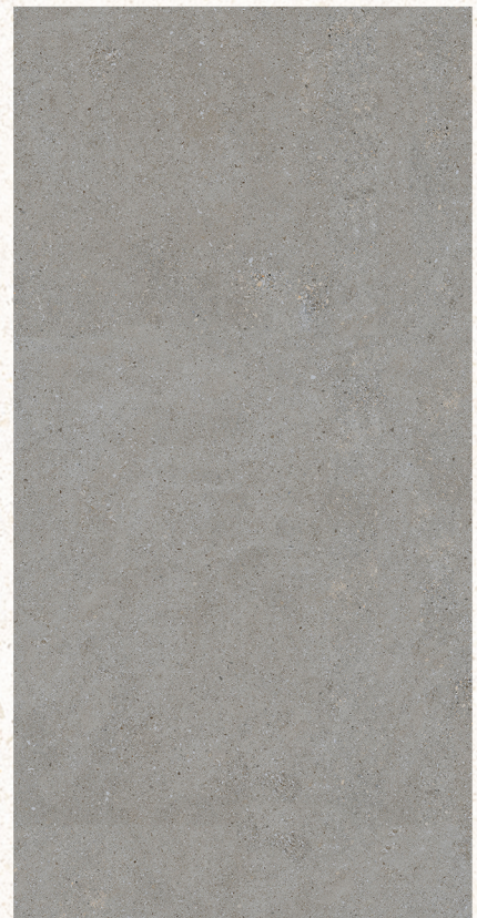
MALTA Mineral matter