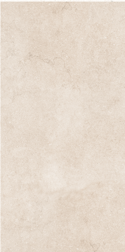
CALCE Lime-plaster inspired

Each series takes its name directly from the material language it represents, creating a clear, honest connection between surface, texture, and application